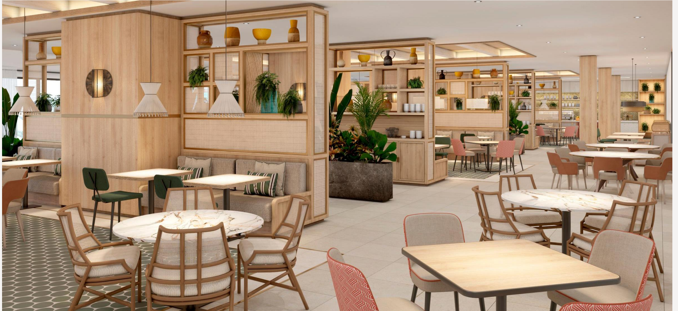
All Day Dining Restaurant